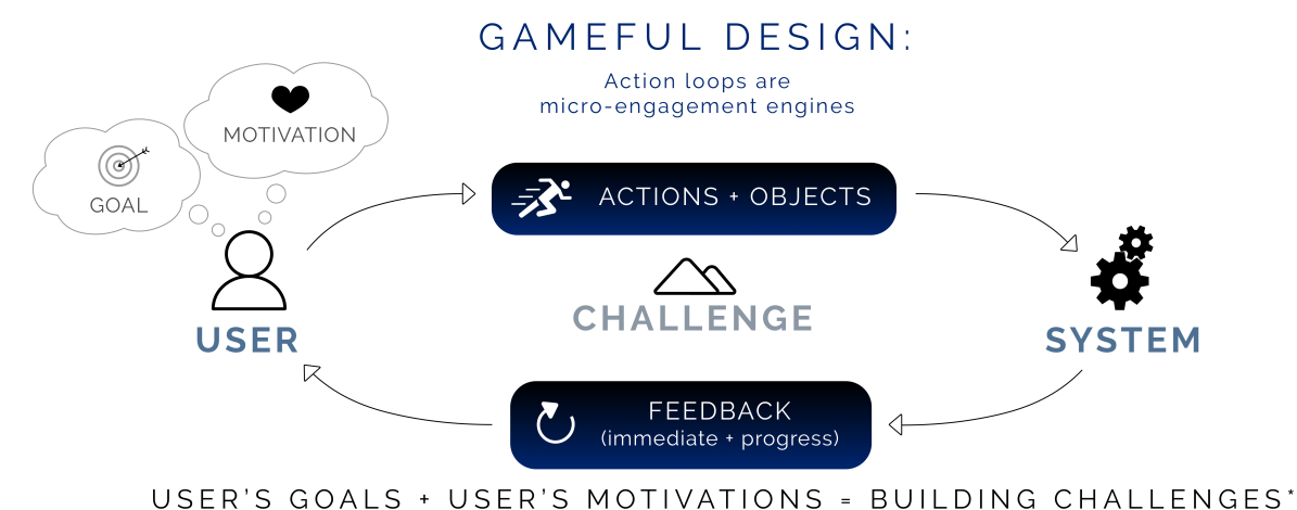
*Address user's fears and drawbacks

The basic unit of the gamification design process are "action-loops." An action-loop serves to boost a user's engagement. Storm Makers can offer Storm Players different ways of aggregating Bolts, like QA Testing. Storm Players track their micro-task progress according to their Bolts earned to date, which can best be characterized as the experience points a Storm Player accumulates as he or she completes tasks. After performing the task, a Storm Player can level up - that is, as the Storm Player's number of total Bolts earned increases, so does the Storm Player's experience rank. Different action-loops can be designed for each of the four phases of the Storm Player's journey to mastery on different treks. Once the Storm Player is done they may redeem their aggregated Bolts for STORM tokens.