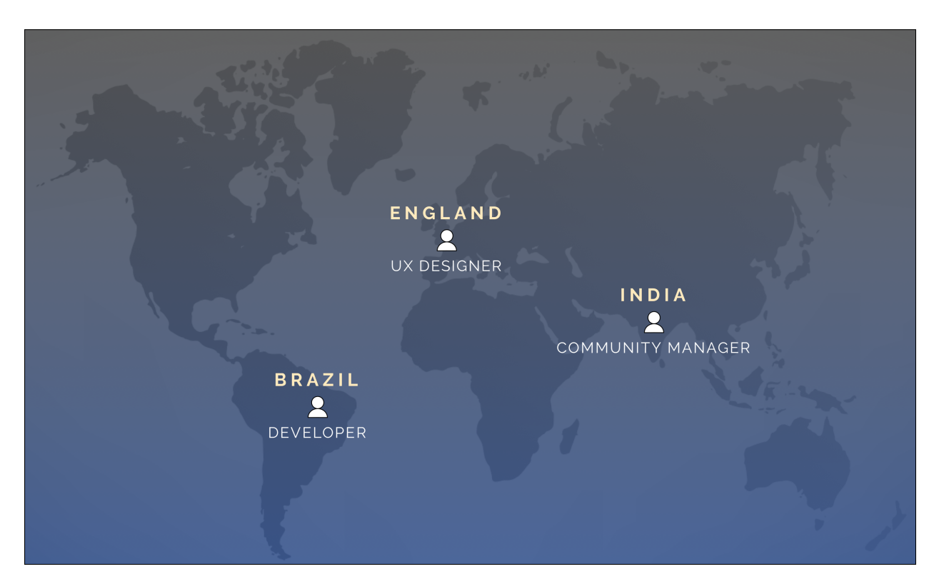
Figure 1: The traditional information worker paradigm is being disrupted by technology and automation.

Centralized platforms have established this as a strong market. Companies like Fiverr, Taskrabbit, Upwork, and Mechanical Turk have their workforces distributed throughout the world, but existing inefficiencies are financially hurting many of these freelancers. Today's platform participants are losing up to 40% of their wages in platform transaction fees,<sup>1</sup> with long transaction periods, and they are not receiving the corresponding value in return. This can create a toxic relationship between the task poster and task performer. Freelancers want to earn more, and to keep more of what they actually do earn. Blockchain can change these dynamics through the efficient listing of tasks and implementation of rewards programs which can be monetized through conversion to STORM tokens.