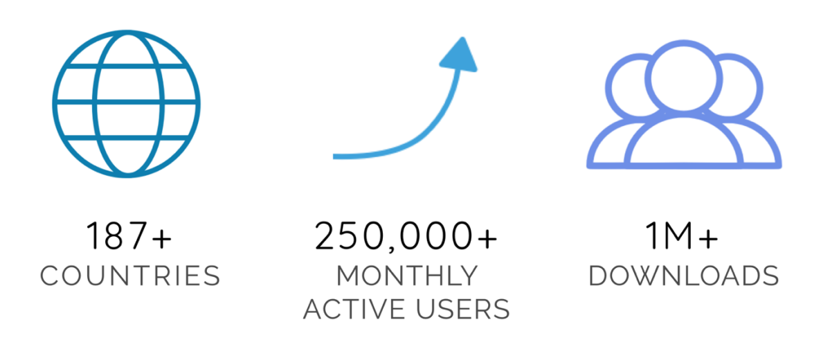
Figure 2: Storm Play's highlight achievements.

Through Storm Play, StormX has already grown a market with 250,000+ monthly active Storm Players. As of August 21, 2017, Storm Market participants have access to: